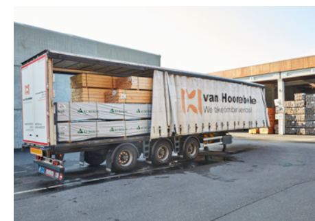
21 st century

A wide range of timber and panels from sustainably managed forests and an excellent service are essential to accomplish our mission namely, to be your trusted partner for quality timber.