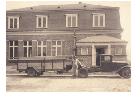
19 th century